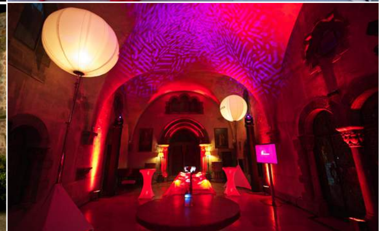
GALA DINNERS, COCKTAILS, AWARD CEREMONIES