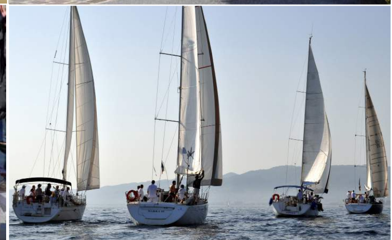
ACTIVITIES, TEAM BUILDINGS & INCENTIVES